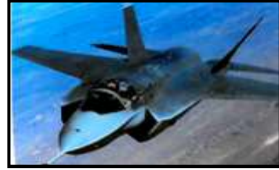
F-22 SUPERSONIC AIR-AIR FIGHTER