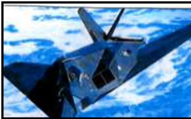
F117A STEALTH FIGHTER

The F-117 'Stealth Fighter' was then produced for the Air Force inventory based on the Have Blue technology successes. Elements of technology from the Tacit Blue demonstrator were directly applied to the B-2 'Stealth Bomber'. Later the supersonic stealth fighter, the F-22, also used earlier proven technology. The operational USAF aircraft, all with the extensive combat records are depicted below: