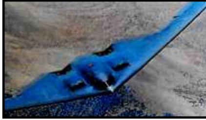
B-2 STEALTH BOMBER